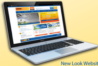
New Look Website

Most of our members now contact us online by email and through our website. Indeed the majority of savings account and loan applications are now received from our website. We are pleased to advise that the Credit Union website has now been upgraded and simplified and is both mobile and tablet compatible.